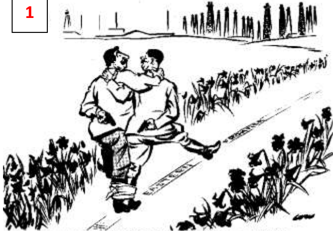
SOMEONE IS TAKING SOMEONE FOR A WALK

Evening Standard, Wednesday, September 20, 1939