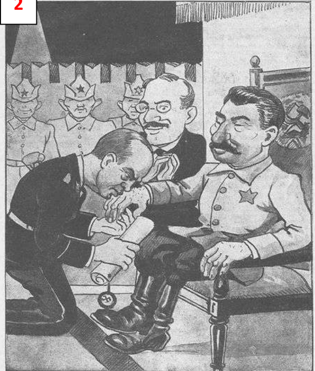
STALIN. — Pakt my tobie, Ribbentropie podpisali. Ty w rączkę nas pocałuj, pakt bierz, a co my zrobimy dalej, to jeszcze podumajem.